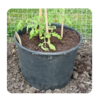
LEARN MORE! <u>Click here for KGD</u> <u>Container Growing</u> Class

Select a container and make sure it has holes in the bottom. You'll need a container large enough for the mature size of your crop. Generally, large containers (18 inches or more in diameter) are needed to grow most crops and only one or two plants will fit (example kale, broccoli, collard you could only fit two plants). You may be able to add smaller varieties like lettuce or herbs around the larger plant. As a general rule, use the <a href="mailto:spacing needed">spacing needed</a> for that crop to judge. For example, kale needs 12-18 inches, so a container at least 12 inches in diameter is ideal. If the container is too small, the plants won't have enough space. You may be able fit more than one crop in a container, but don't crowd the plants too much or the plants won't have the space and nutrients needed to grow.